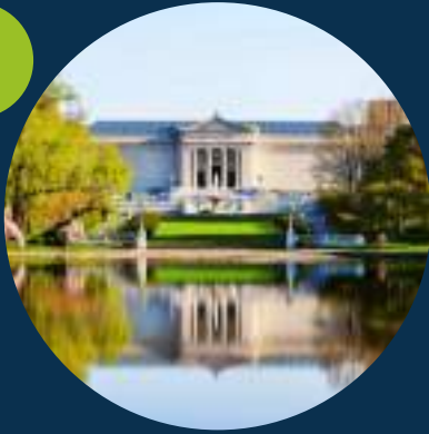
Cleveland Museum of Art