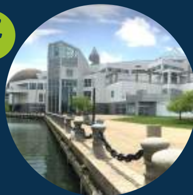
Great Lakes Science Center