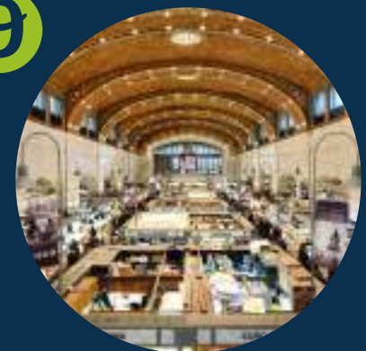
West Side Market