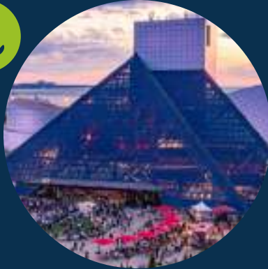
Rock & Roll Hall of Fame